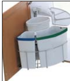
• Under Bench Bins