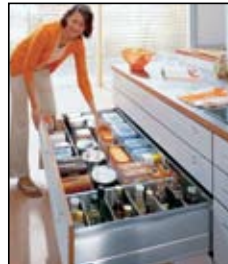
• Drawer Solutions