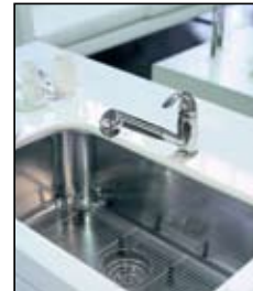
• Sinks & Taps